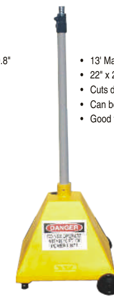
13' Pyramid Base