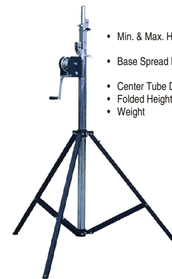
14' Crank Tripod